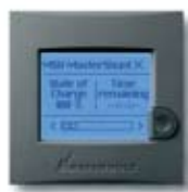
MasterView Easy control panel Article no. 77010300