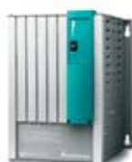
Mass GI isolation transformer 7 Article no. 88000705