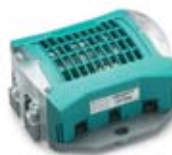
MasterShunt 500 Article no. 77020100