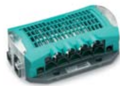
DC Distribution 500 Article no. 77020200