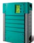
ChargeMaster 3 24/80-3 & 24/100-3