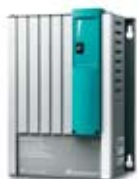
Mass GI isolation transformer 3.5 Article no. 88000355