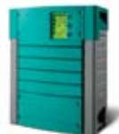
ChargeMaster 2 12/70-3, 12/100-3, 24/40-3 24/60-3