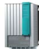
Mass Systemswitch 6, 10 & 16